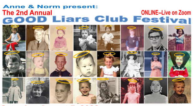
Saturday, August 5, 2023 1:00-7:00 Pacific / 4:00-10:00 Eastern 6 Showcases ★ 24 Tellers ★ Full schedule at: www.anne-norm.com/glc-festival-2023 Register at: https://tinyurl.com/goodliarsclubfestival2023 Donate to the tellers at: https://tinyurl.com/GLCFest2023Donate All who donate will be able to watch the festival for two weeks after the event.

Audience members can drop in and out for as many showcases as they please, or stay for the whole festival of fabulation.